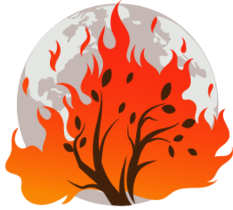
The Burning Bush Ex 3:1-12